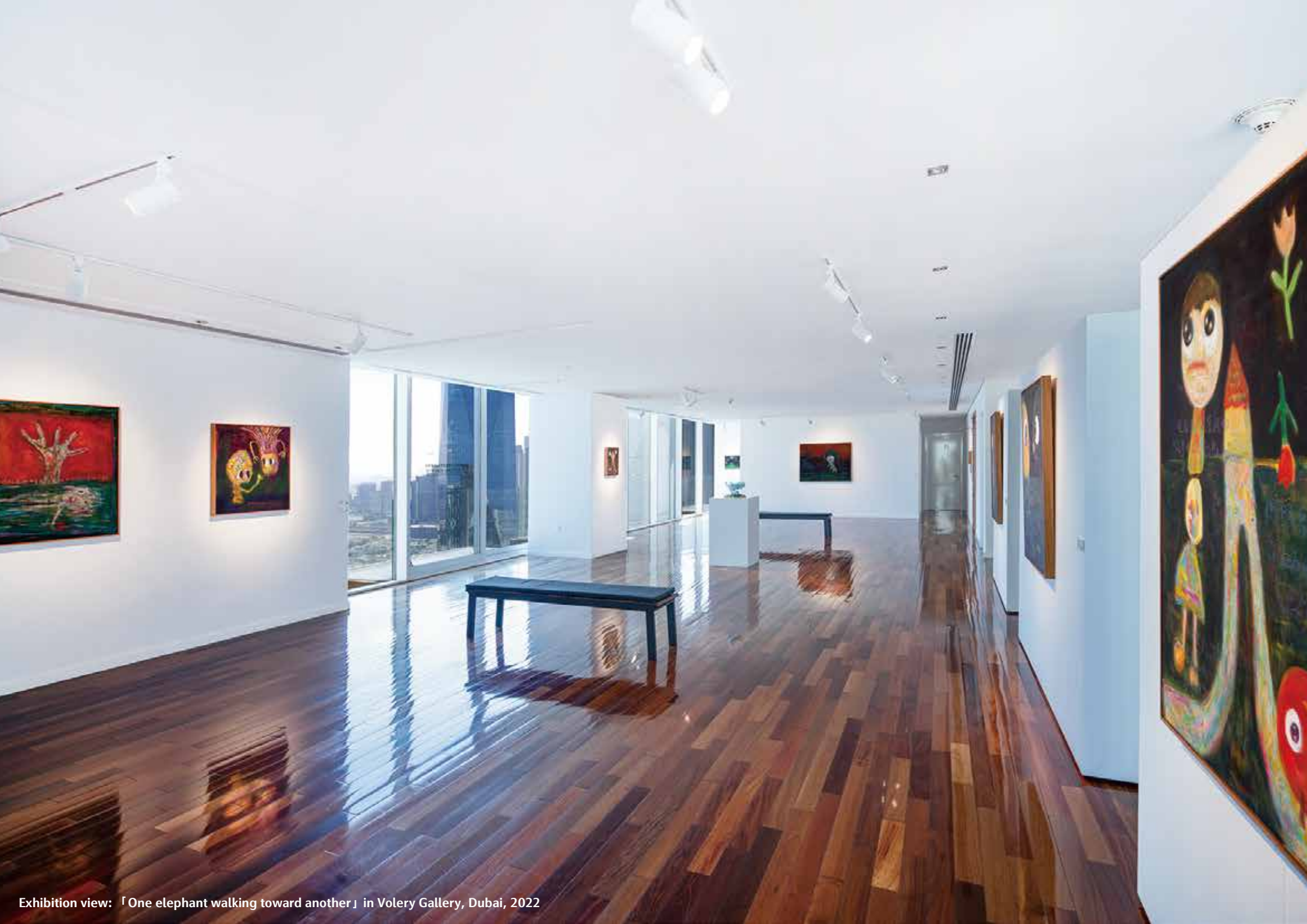
Exhibition view: 「One elephant walking toward another」 in Volery Gallery, Dubai, 2022