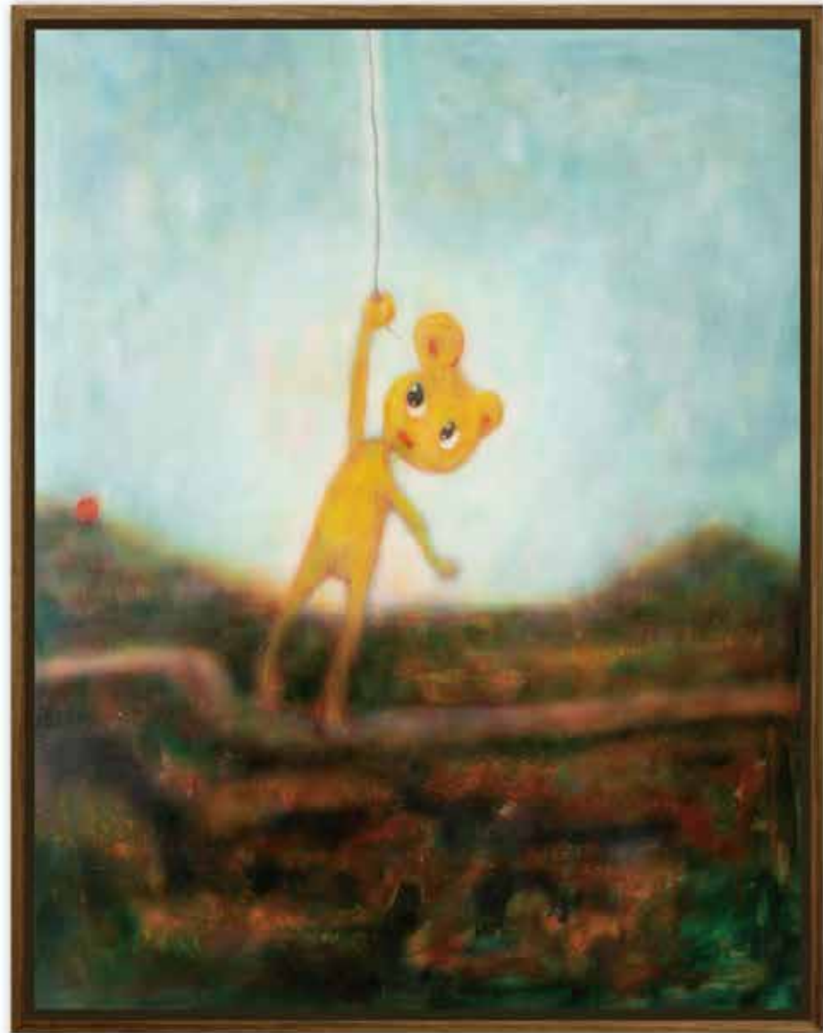
I will follow you into somewhere, 2023, acrylic, oil pastel and colored pencil on canvas, 115.4 x 148.4 cm