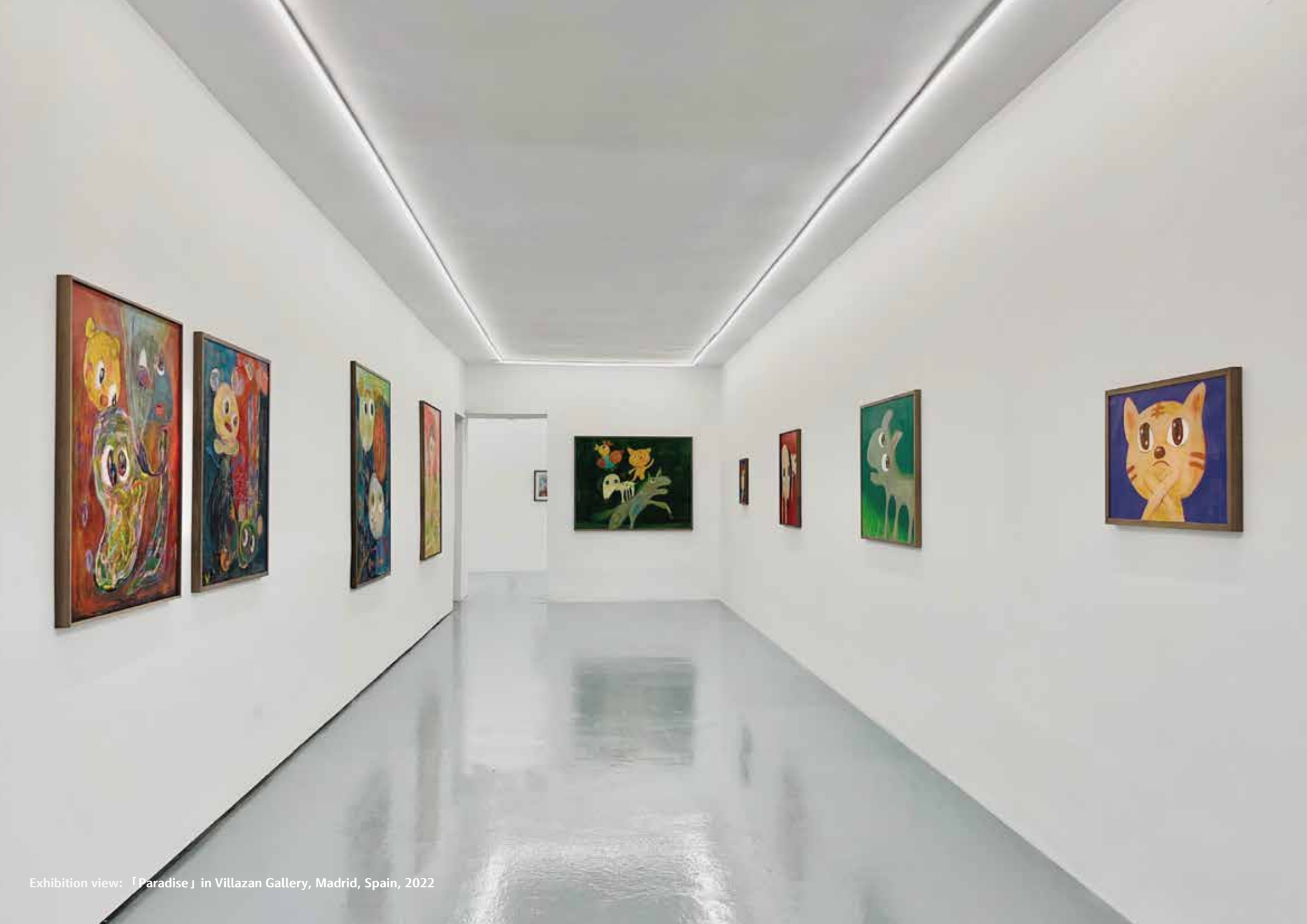
Exhibition view: 「Paradise」 in Villazan Gallery, Madrid, Spain, 2022