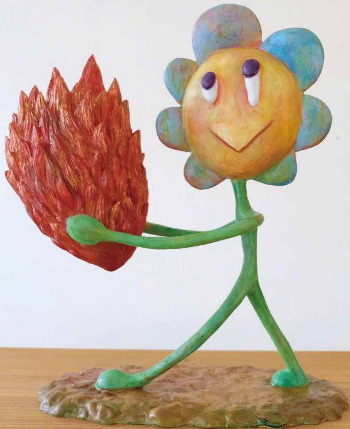
You'll see 2019 acrylic and color pencil on FRP H38 cm