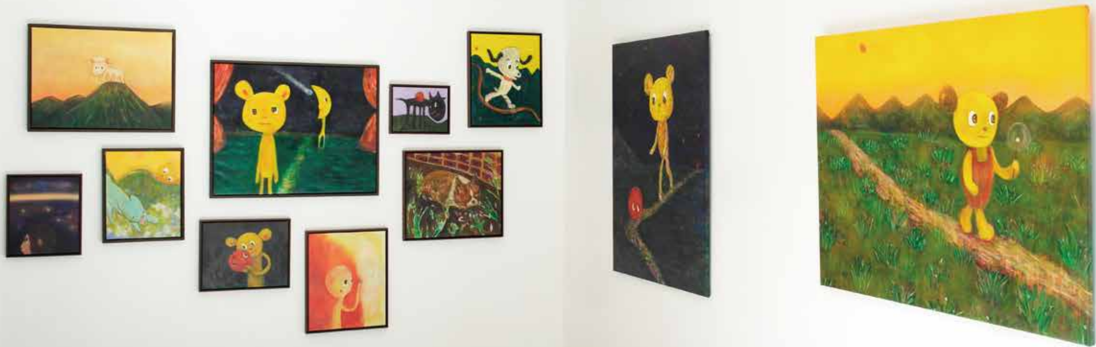
Exhibition view: 「July 2023 Art Residency」 The Fores Project, London, England, 2023