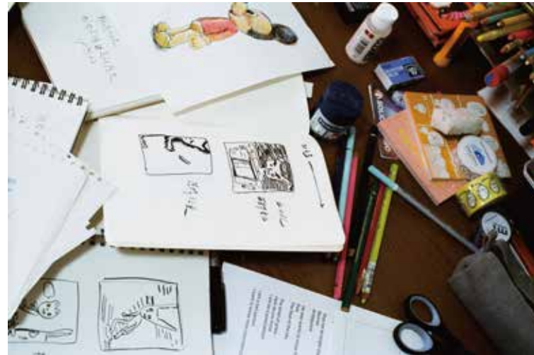
CHEN WEI TING