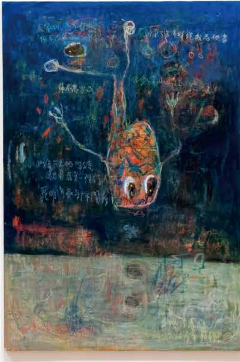
Falling and see yourself, 2022, acrylic, oil pastel and colored pencil on canvas, 194x130cm