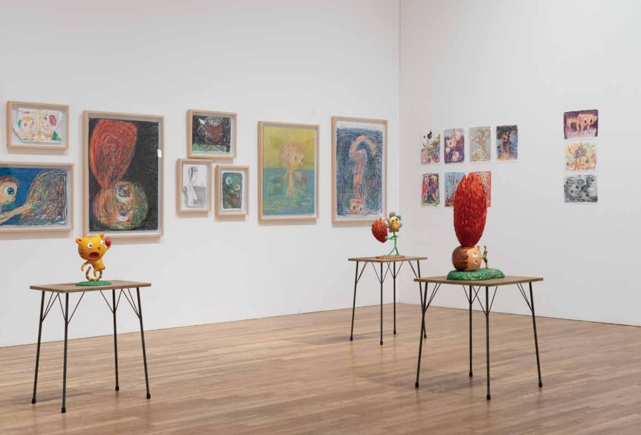
Exhibition view: 「Graduation Works Exhibition 2022」 The University Art Museum, Japan, 2022