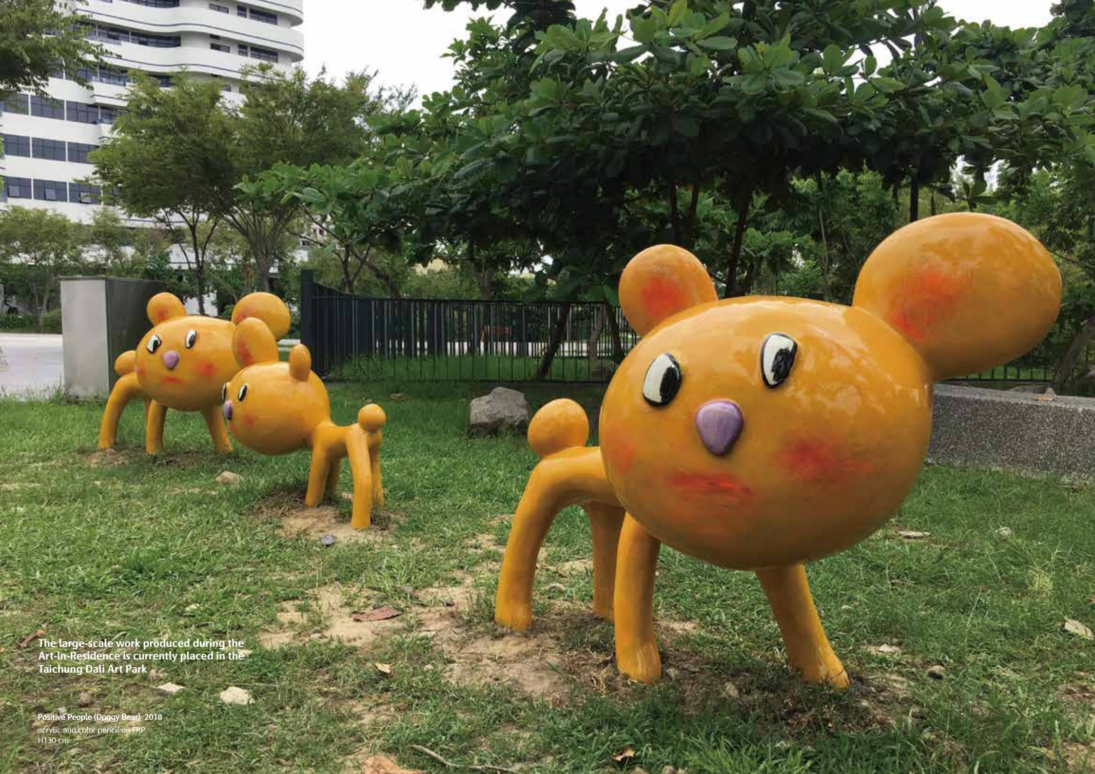
The large-scale work produced during the Art-In-Residence is currently placed in the Taichung Dali Art Park

Positive People (Doggy Bear) 2018 acrylic and color pencil on FRP H130 cm