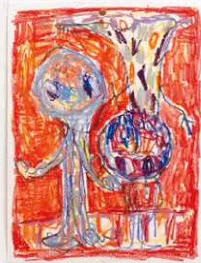
Daily drawing series, 2022, oil pastel and colored pencil on paper, 29.5x40cm