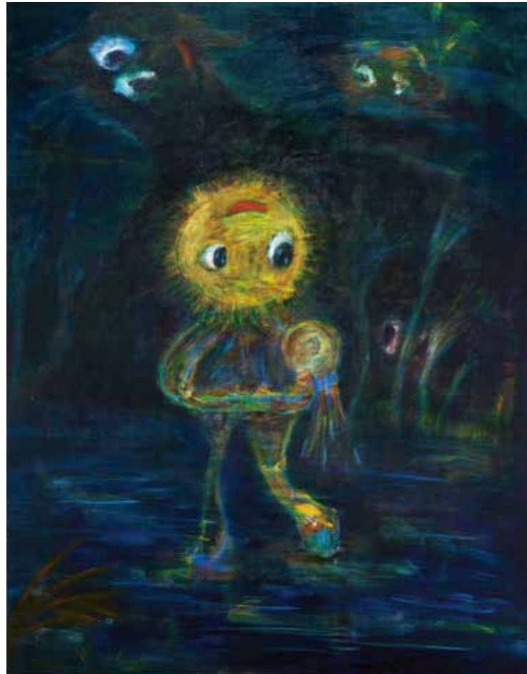
The sun that stole the moon, 2022 acrylic, oil pastel on canvas 145 x 122 cm